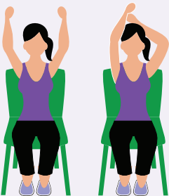
STRETCH & RELEASE