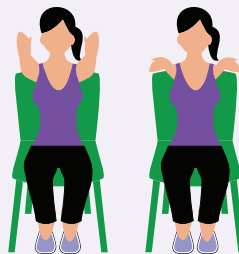
PUSH & PULL