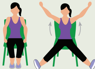
CHAIR JUMPING JACKS